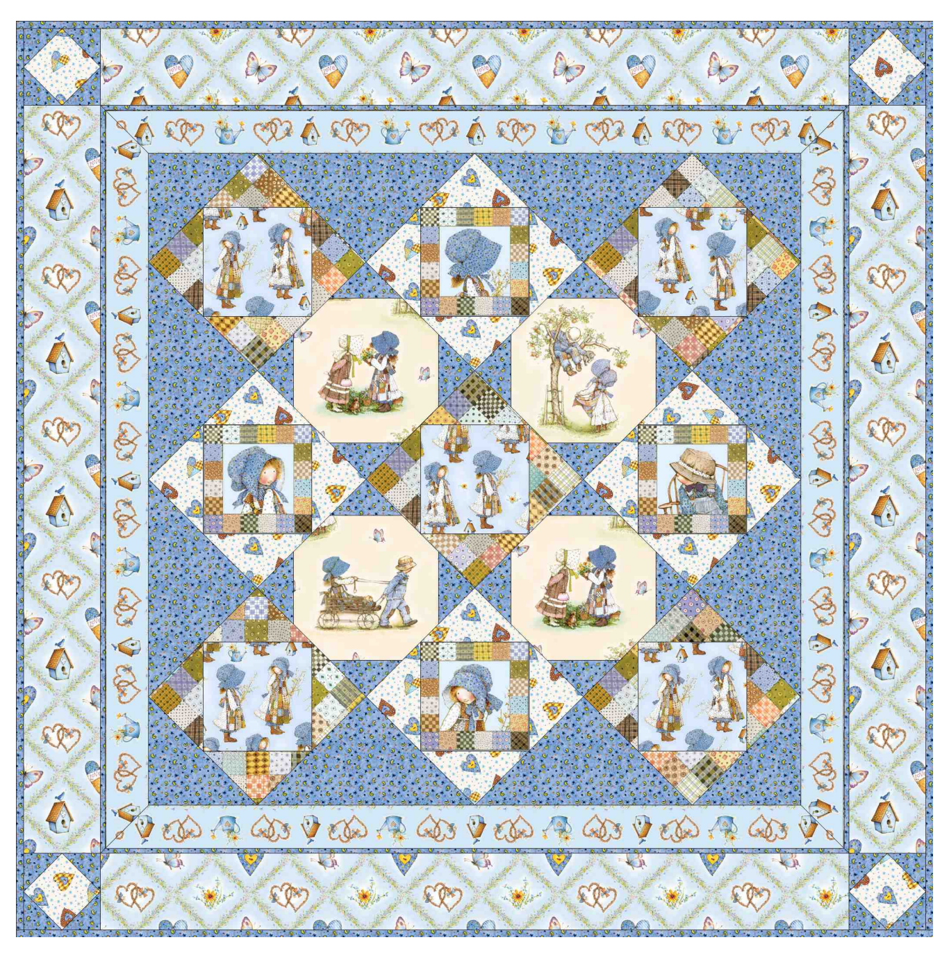
Approximately 46" x 46"